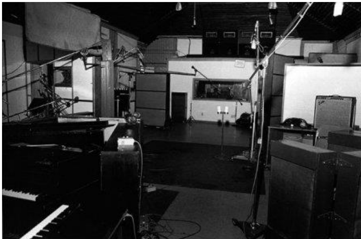
Interior of Owen Bradley's Quonset Hut studio

Farther out toward the West End of Nashville, Music Row, as it came to be known, was taking shape. Bradley was one of its masterminds, having built a studio with his brother in 1952, to which they later added an adjacent metal “Quonset Hut”, which is now part of Sony-Columbia. It was soon christened “Bradley’s Barn”. On the main floor was a studio for and in the basement, Bradley created one of the most technically advanced recording studios in the region.