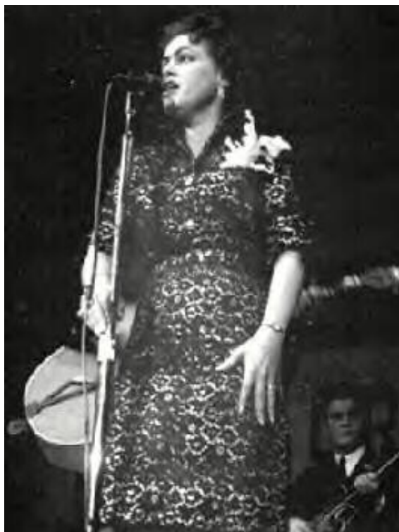
Patsy singing at Carnegie Hall, Nov. 1961

A NYC writer interviewing Patsy was so impressed, he raved: "Patsy Cline comes over like Ava Gardner, Marilyn Monroe, and Gina Lollobrigida all rolled up in one!"