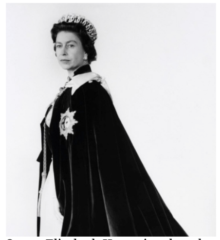
Queen Elizabeth II wearing the robes and seal of the Order of the Garter in 1969

Order of the Garter: The most senior and the oldest British Order of Chivalry. The Order is comprised of the King and twenty-five knights, honored for particular service to the nation or the Sovereign.