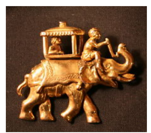
a brooch depicting a princess on a howdah

Howdah: A seat or platform for one or more persons, placed on the back of an elephant so that it may be ridden.