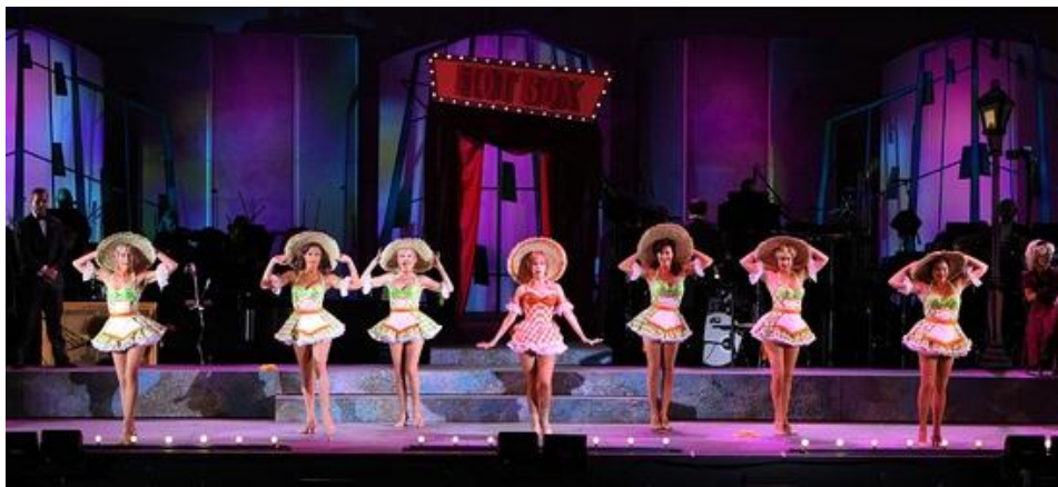
Ellen Greene as Adelaide, with the Hot Box Girls