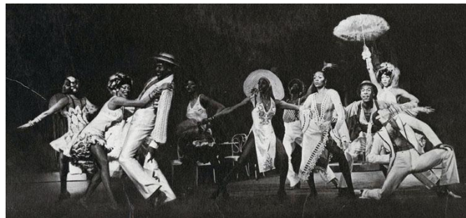
All Black 1976 Broadway Revival