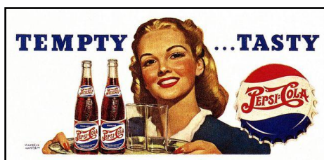
1940s Pepsi Advertisement