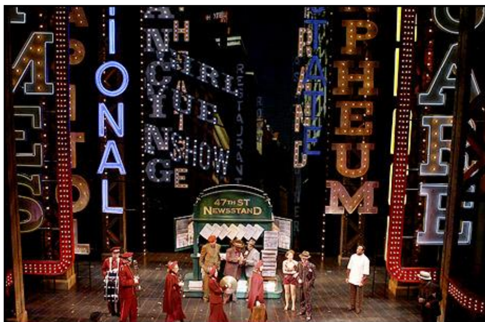
2009 Broadway Revival of Guys and Dolls

Our production places it somewhere in the 1945-1948 range (just to give it roots), but we allow flexibility in time, since what we are really presenting is a Broadway Fable. This is not a historical work. In a sense what is presented is a fantasy version of Broadway in the 1930-1950s. This is why it is almost more accurate to say it is set in the "Time of Damon Runyon," or "Runyonland."