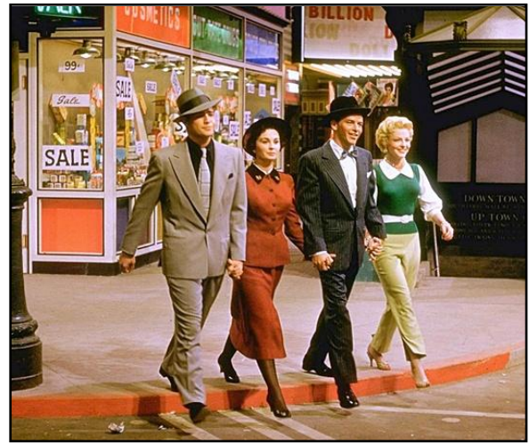
1955 Film Starring Marlon Brando, Jean Simmons, Frank Sinatra, and Vivian Blaine