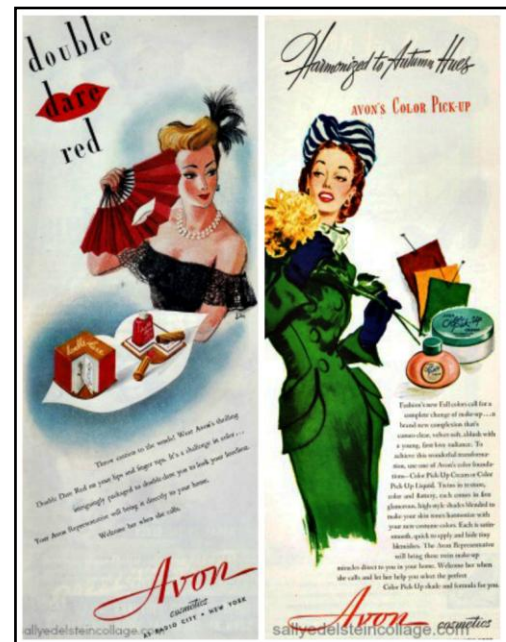
Avon Ad from 1947