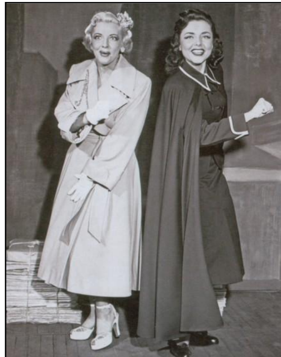
Vivian Blaine and Isabel Bigley as Miss Adelaide and Sister Sarah Brown