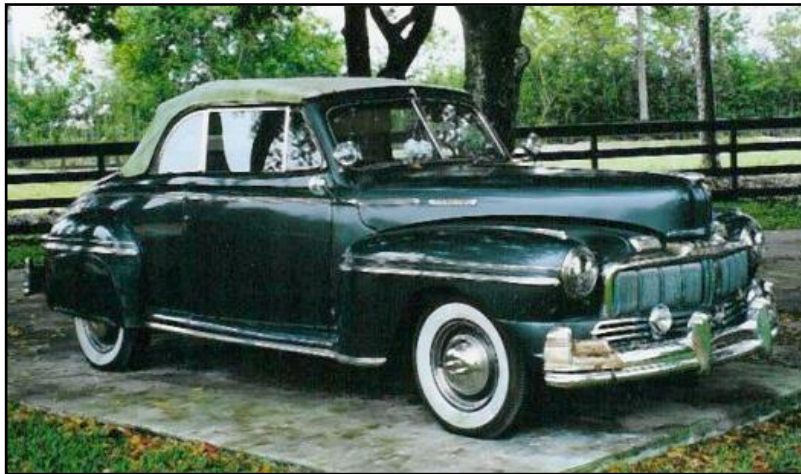
1947 Mercury Convertible