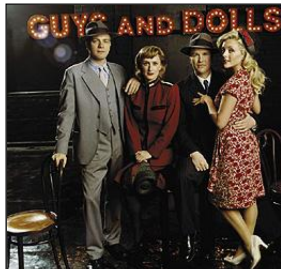
Ewan McGregor, Jenna Russell, Douglas Hodge, and Jane Krakowski star in the 2005 London Revival