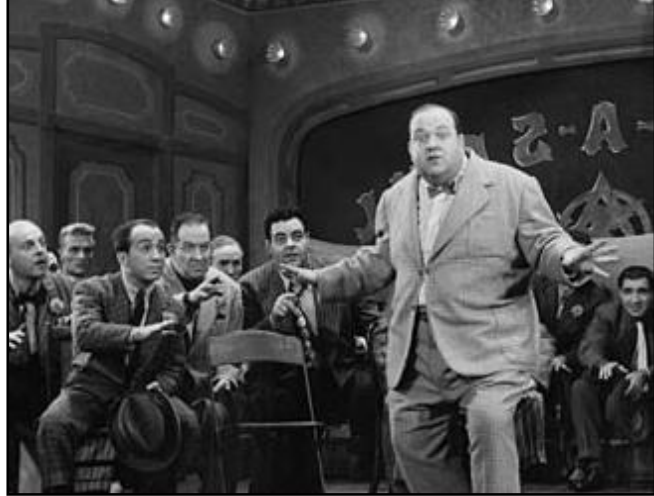
Stubby Kaye, "Sit Down, You're Rockin' the Boat"; Original Broadway Cast