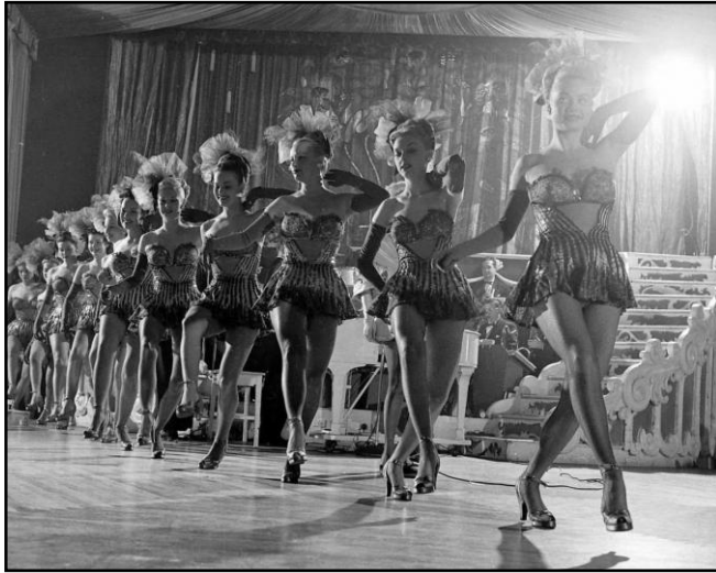
1940s Chorus Girls

The Hot Box girls in Guys and Dolls are chorus girls. Also referred to as a “chorus line,” these girls dance and sing in synchronization (“Chorus Line”). Still employed in musical theatre today, in the first half of the 20 th century they were seen in vaudeville acts, revues, and cabaret shows. On the more risqué end of things is the show girl. Show girls’ performances are more provocative and generally feature less clothing. Some productions of Guys and Dolls lean more towards typical the chorus girl, while others lean towards the show girl. Our production of Guys and Dolls will present the Hotbox girls as chorus girls, not show girls.