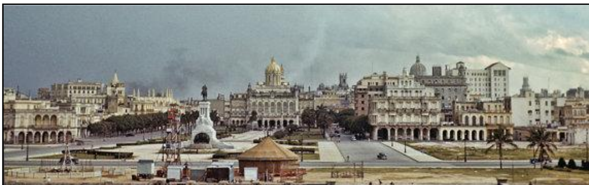
1940s Havana, Cuba