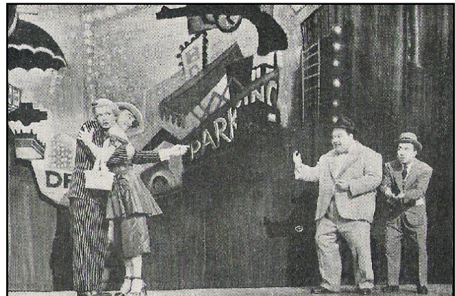
Original London Production, 1953