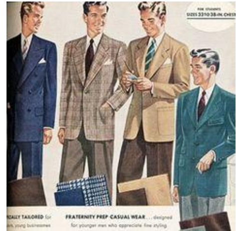
1948 Men's Fashions