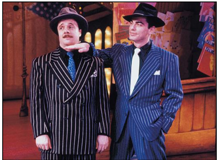
Nathan Lane and Peter Gallagher as Nathan Detroit and Sky Masterson in the 1992 Broadway Revival