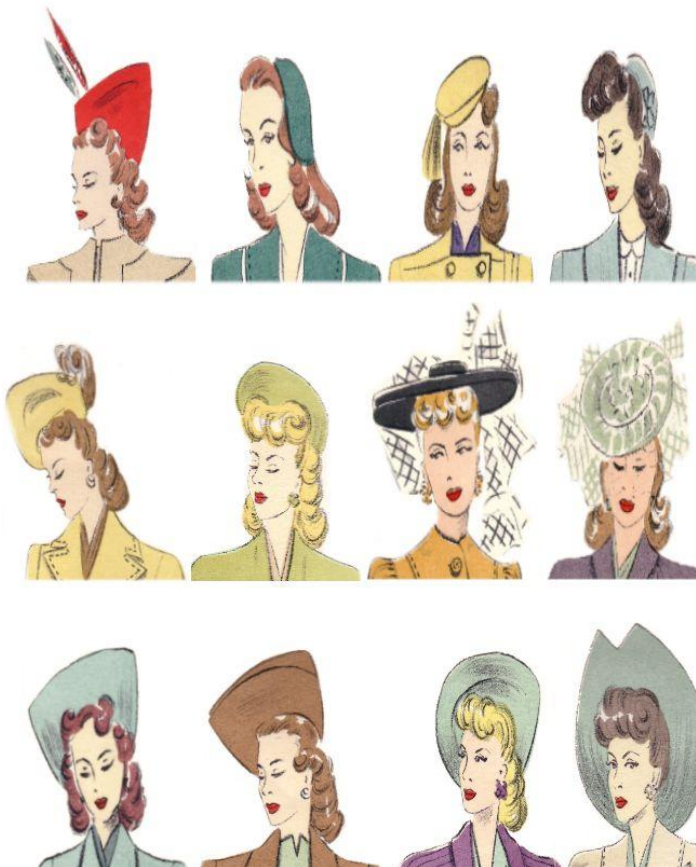
1946 Hats and Hairstyles