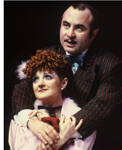
Bob Hoskins and Julie McKenzie star as Nathan Detroit and Miss Adelaide in the 1982 London Revival